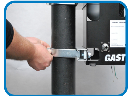
Secure lower pipe clamp