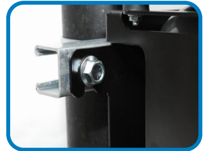
Hang system on bracket