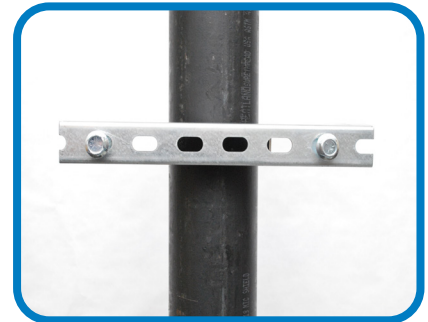
Mount bracket using pipe clamp